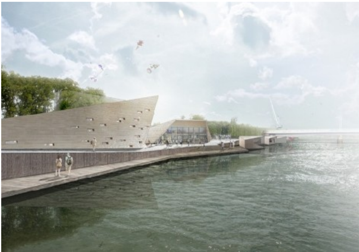
This project demands total changes in the bank of the river and existing pier as it is inspired by medieval bastions.

The project is well balanced considering Pärnu's size and capabilities (not too pompous, intimate and cozy). In its modesty, however, it acts as a landmark (maybe should be even a bit higher). Pavilions with separate wooden platform on the river are forming their own "street of galleries".