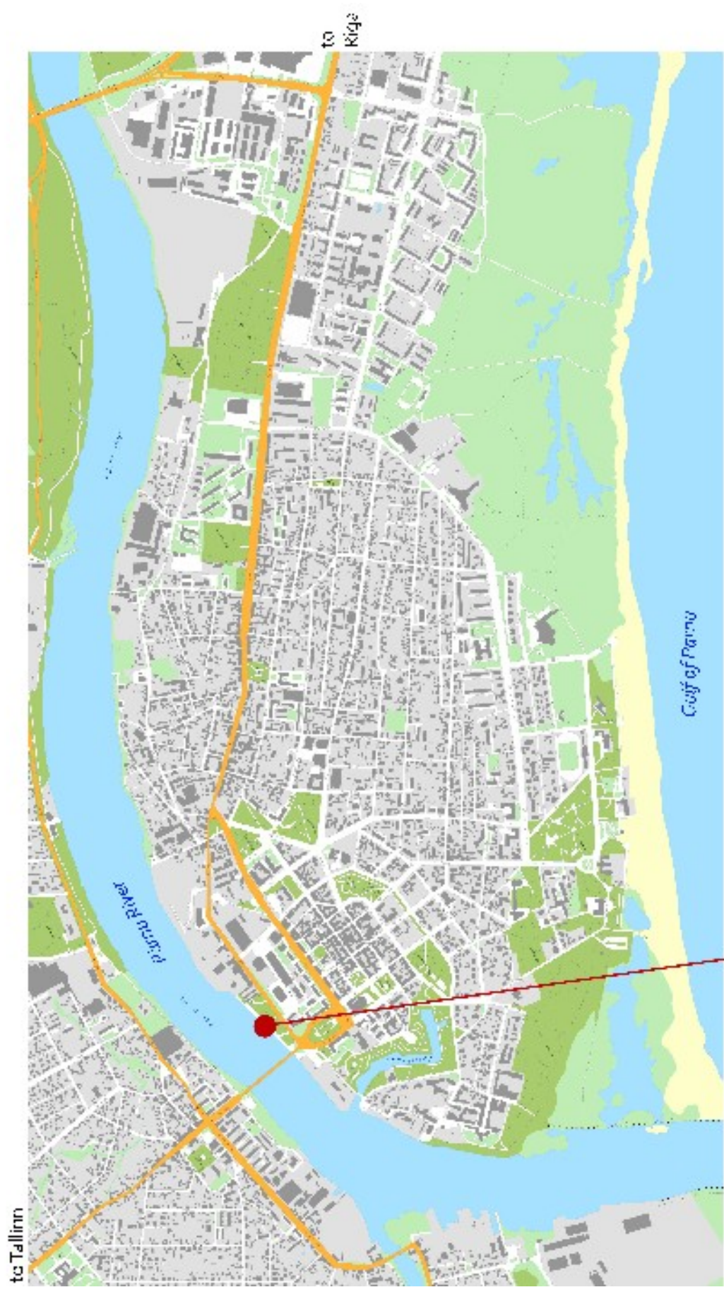
The Baltic Sea Art Port will appear in the downtown of Pärnu, between Concert Hall and riverside, on a medieval Hanseatic marketplace.