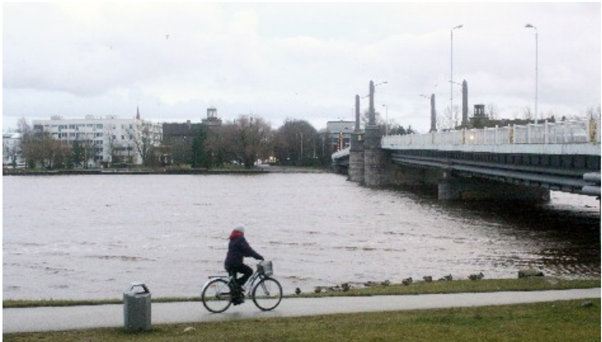
The skyline of Pärnu in November 2015.