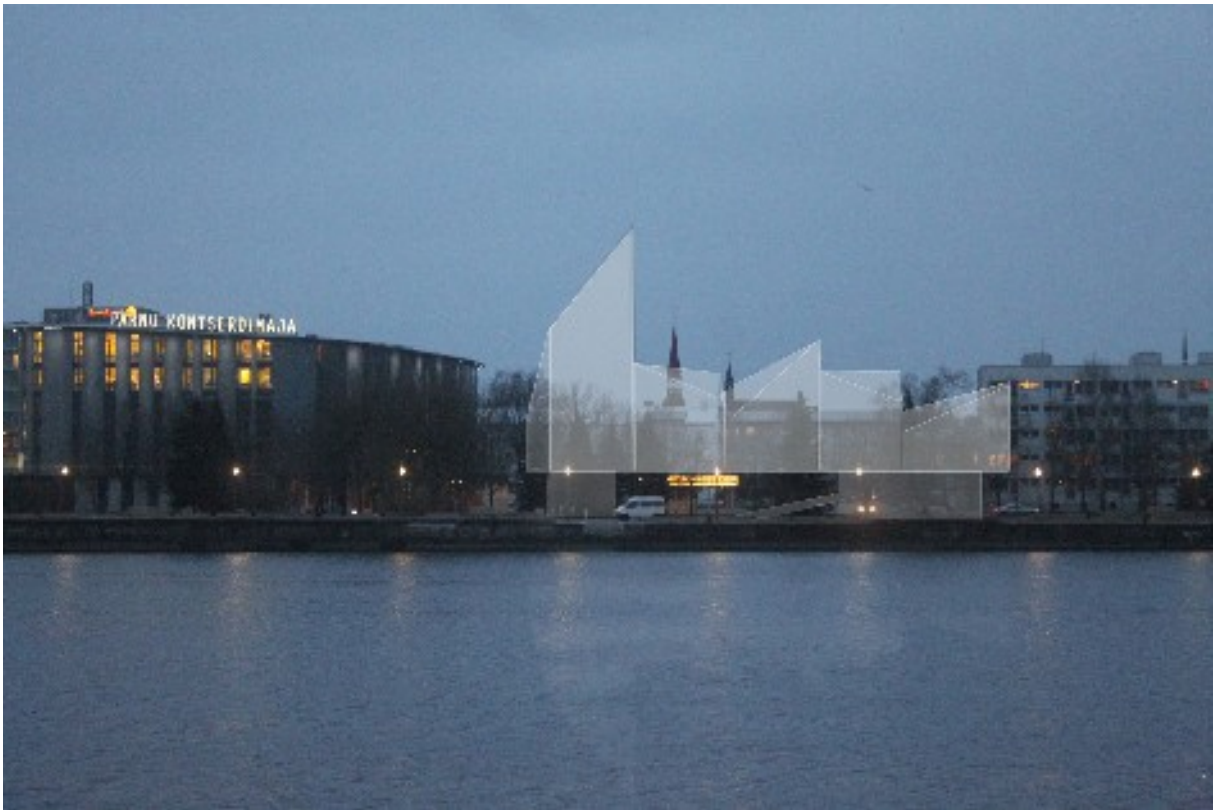
And this is how it will look like from the other bank of the river when the BSAP opens its doors for creative folks from all over the world.