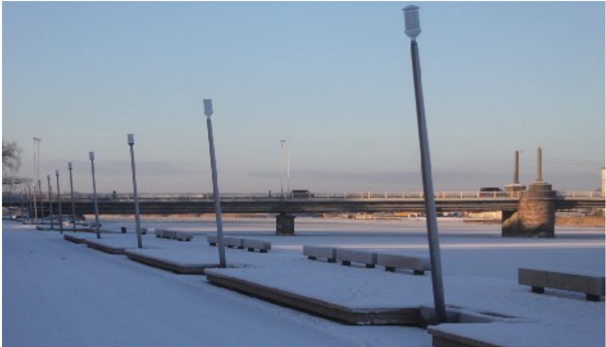
The Pärnu River is sleeping under ice and the pier nearby Suursild is covered with white blanket. It is a nice winter relaxation in our latitude. When the Baltic Sea Art Port will open the main art hall and in summertime its pavilions, the calm place becomes quite crowded...