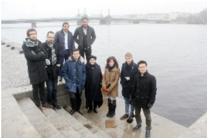
Architects from Bucuresti, London and Bilbao loved the location for the future art port.