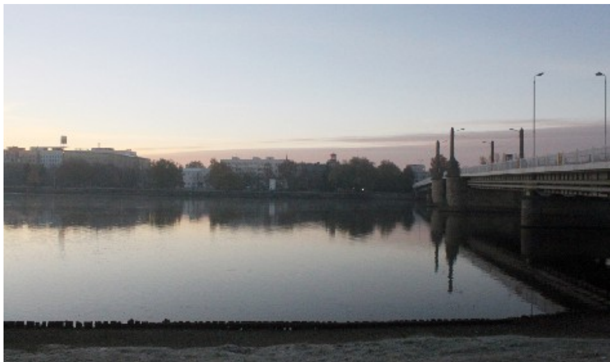
Over there, behind the calm water and morning mist, the future art port will appear one nice day....