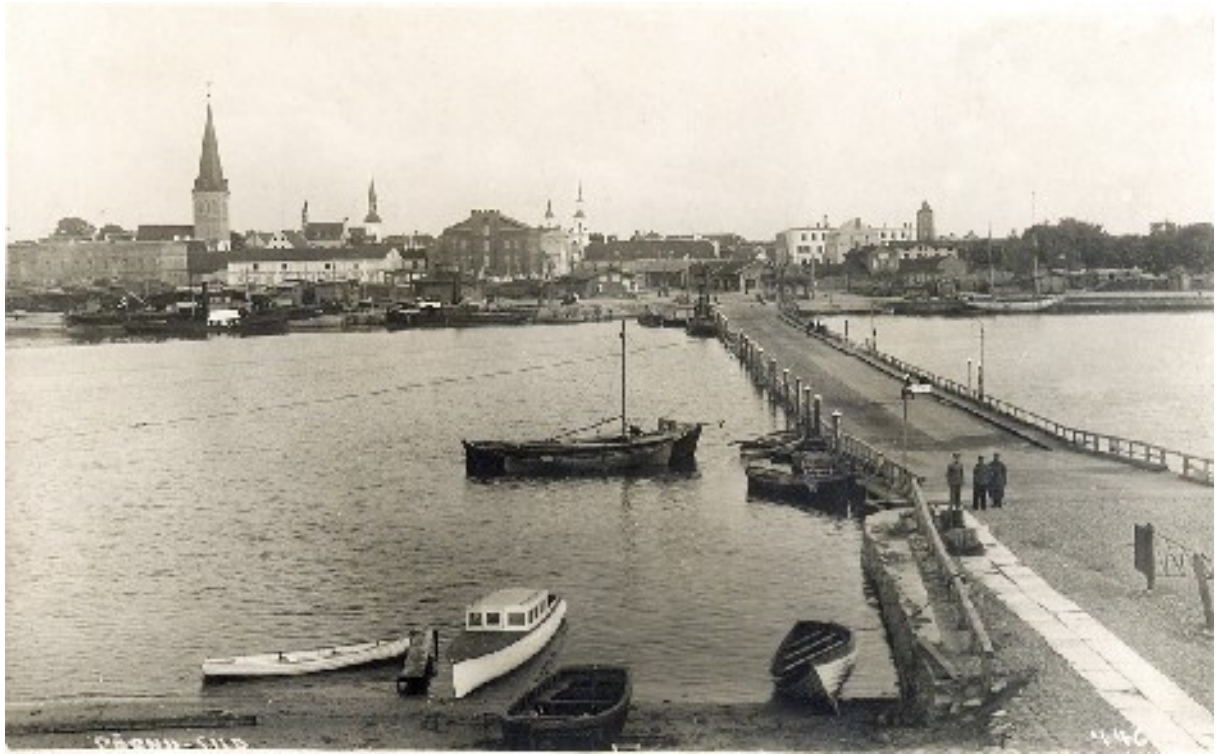
The skyline of downtown of Pärnu in 1930-ies.