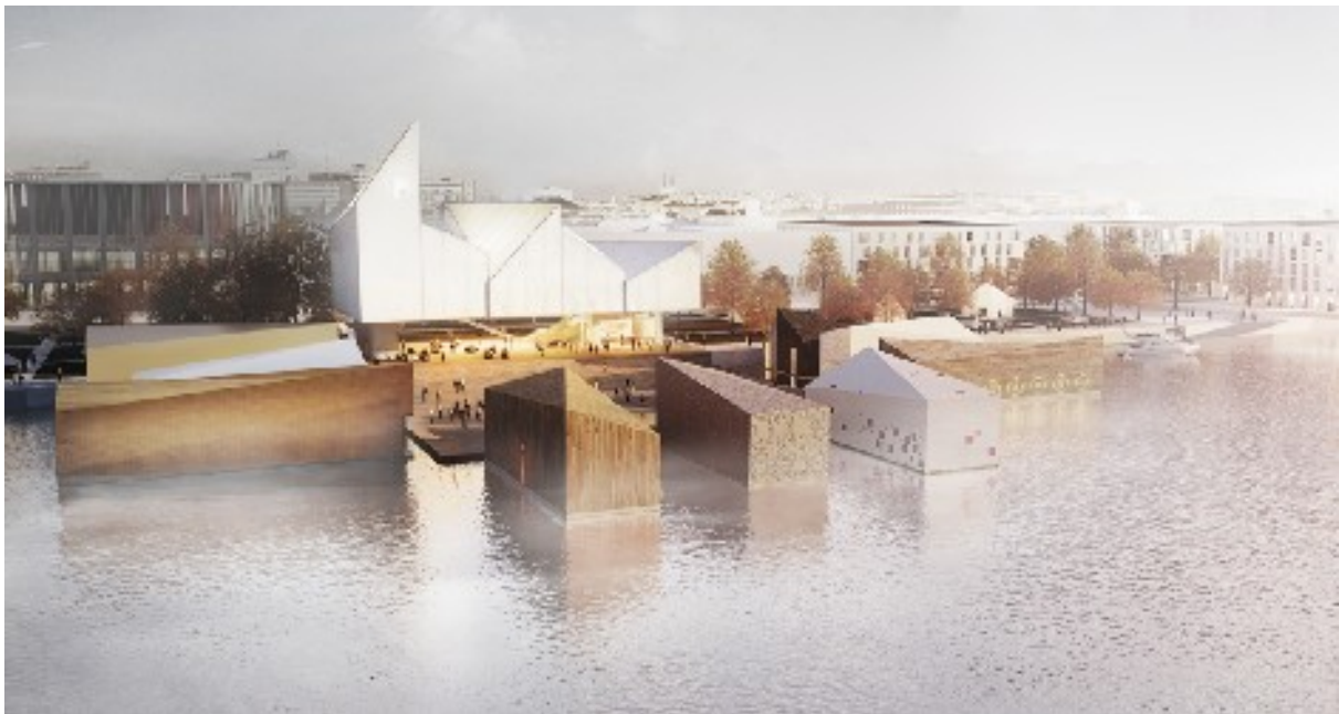
The Main Art Hall in origami style reminds of the tower of St Nikolaus' Church at the same spot in the old skyline of Pärnu.

The main attraction of this entry is a floating square moored to the riverbank. The national pavilions are placed alongside the square, like buildings around a town square. This arrangement secures good circulation to and between the pavilions. This also secures a consistent appearance thus keeping open the final design for the national pavilions. As shown in the plans, this arrangement allows the pavilions to be built in different sizes and shapes according to the needs of the individual country without compromising the outcome. This vision brings a new landmark to Pärnu and will be a great market place for artists from the Baltic Sea countries. It would be the best art-link between the past and the future in the historical Hanseatic town of Pärnu.